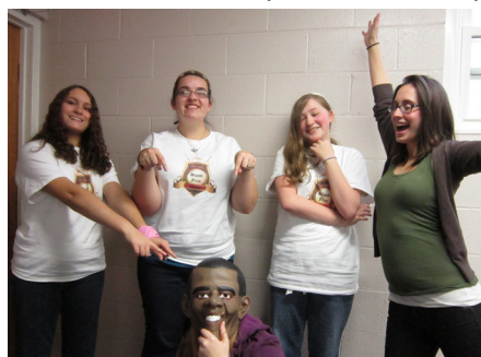
♥ Mark My Words!

CEPC Wall of Hostility—90, ♥ Mark My Words!—180, MB Guardians—0