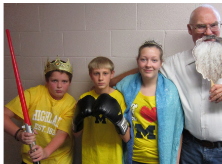
Marimont Community Church Charge